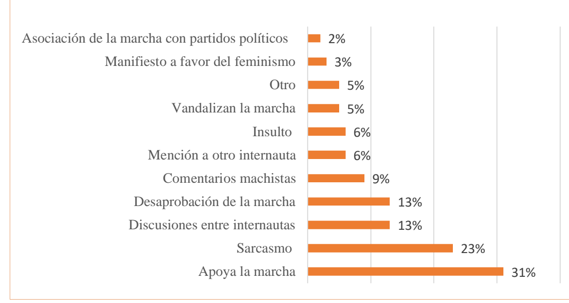
Graphic 1. Types of comments on the 8M 2021 march in Tampico, Tamaulipas

of this research; however, since they showed a high frequency, they were considered in graph 1. It is necessary to clarify that some comments could be placed in two or more categories, because, for example, a sexist comment could also include insults or high-flown words.